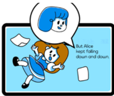
① Enter the story, Freckles Schmeckles .