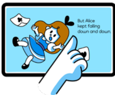
③ Record your voice for the subtitle.